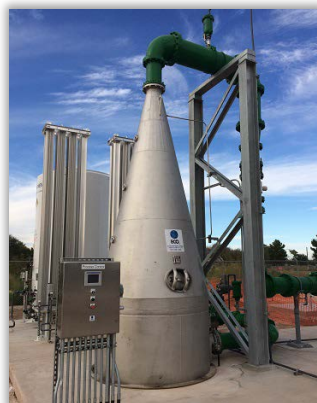
Speece Cone by ECO 2